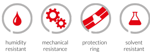
Plate mounting sleeve for use on roto-offset presses with variable format in the printing range 14"-32" especially designed for label and narrow web printing. The sleeves are totally encapsulated in fibreglass with an external layer of special polyurethane PU Evergreen. The high thickness PU layer of the Lito Green Plate Sleeve has the special offset plate holding configuration to allow the installation of the aluminum offset plate. The protection steel ring integrates the register notch.